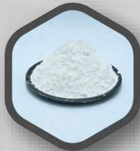
Calcium Carbonate Precipitated